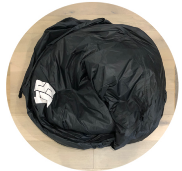
I: Tent Body (Folded)

A: Tent Roof Cover: The purpose of the tent roof cover is to ensure additional protection during rain. It covers the entire roof of the tent. It attaches to main tent via metal clips (carabiners) in all four corners.