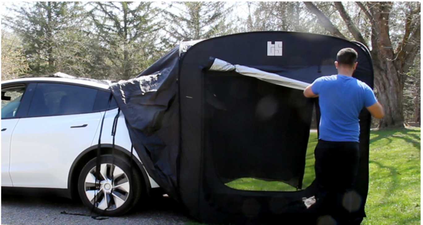
Roll up one side to enter inside and check alignment with the vehicle

Once the hatch is covered, roll up one side of the screen and secure it open using the two black loops with plastic ends onto the tent itself. This will allow you to easily get in and out of the tent for remainder of the setup.