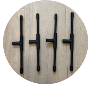
C: Support Bar Holder