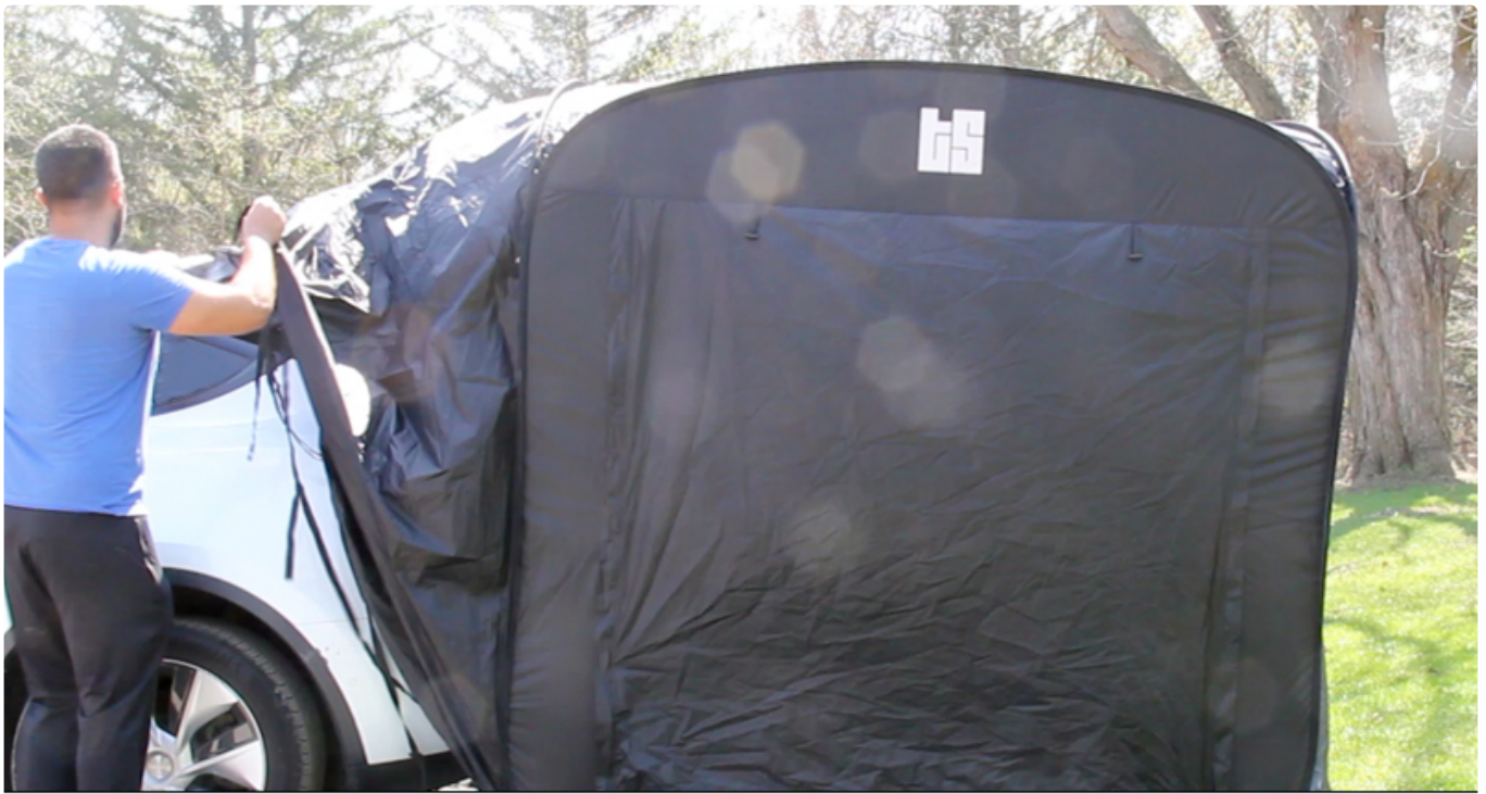
Lower hatch for ease and pull the tent cover over

Once the hatch is covered, roll up one side of the screen and secure it open using the two black loops with plastic ends onto the tent itself. This will allow you to easily get in and out of the tent for remainder of the setup.