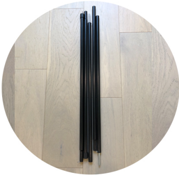
D: Awning Posts