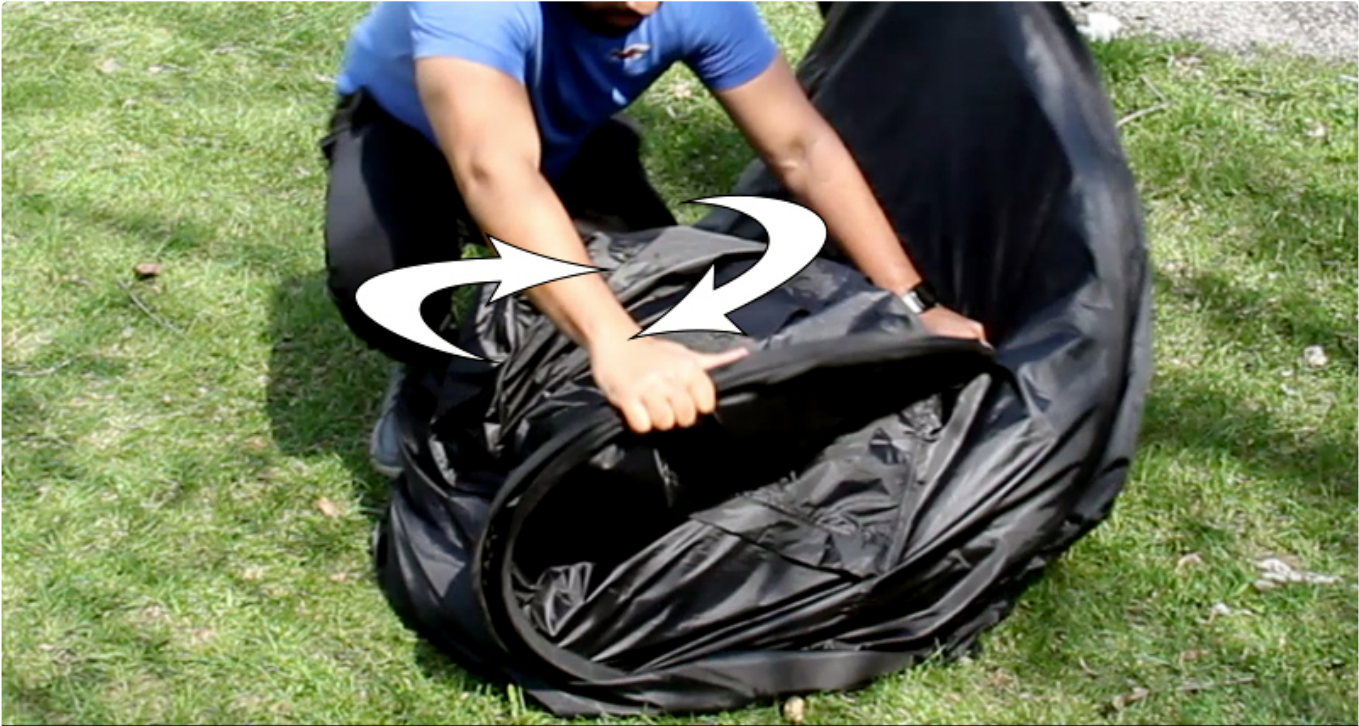
Fold the bottom side inwards while twisting in circular manner at the same time

Then fold the bottom end inwards while twisting in a circular manner at the same time. You just have to focus on one end. If done right, the other end will want to close on by itself.