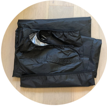
A: Tent Roof Cover