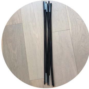
B: Roof Support Bars