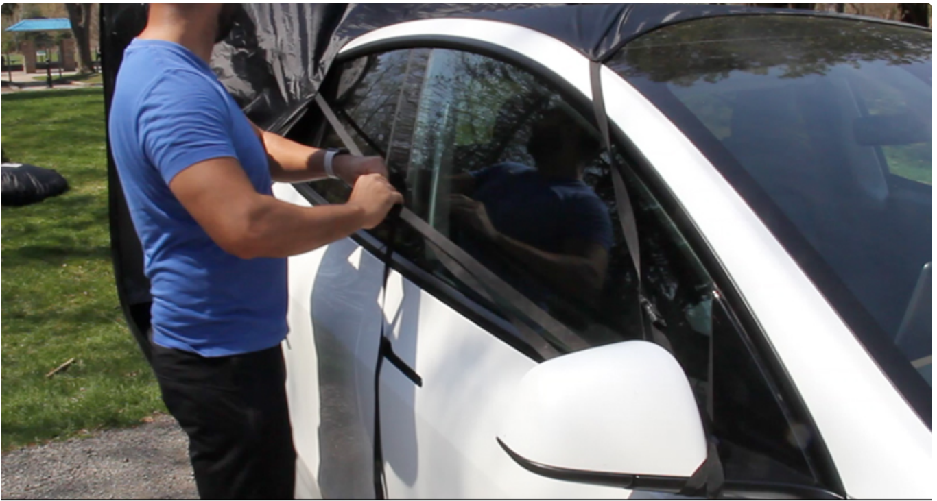
Top two straps secured to rear view mirror