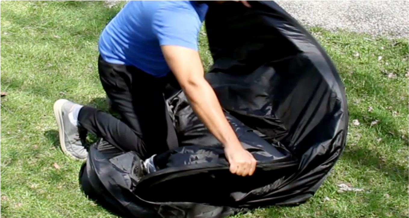
Focus on one side and the other side will want to fold inside freely