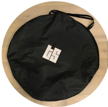
H: Storage Bag